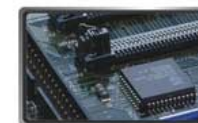
质量稳定 经久耐用 Steady Quality Long Service Life