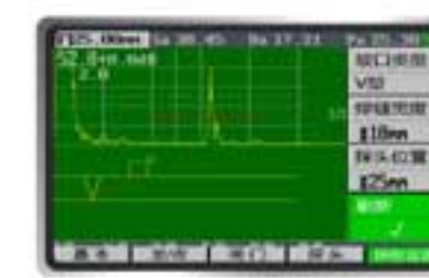
焊缝检测图形示意功能 Weld graph illustrative