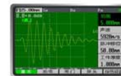
射频检波功能 RF display function