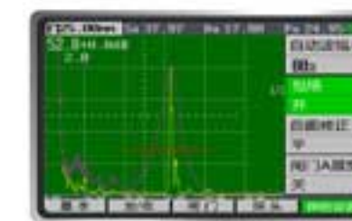
包络功能 Envelop function