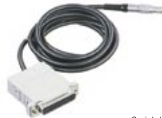
Serial data cable for printer and PC