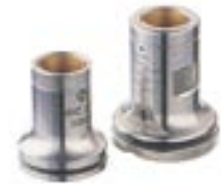
Flat probe shoe attachment MIC 270 Prism shoe attachment MIC 271