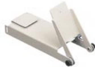
Instrument carrier and prop-up stand MIC 1040