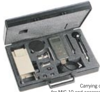
Carrying case for MIC 10 and accessories