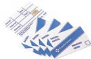
Memory cards for the storage of measurement and calibration data as well as report formats